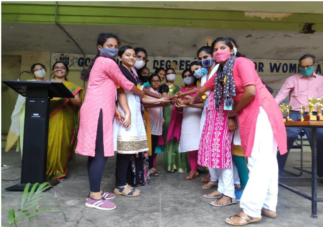
Fig 2. Prize distribution