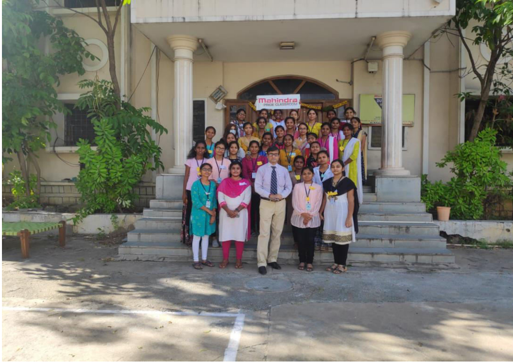
Fig 1. Group photo with trainer